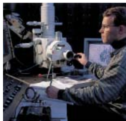
AlfaNova is the result of extensive research in the fields of materials and brazing technology.

AlfaNova was tested in three different temperature and flow programmes and